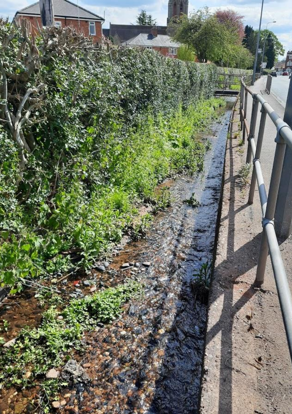
Spadesbourne Brook, Bromsgrove