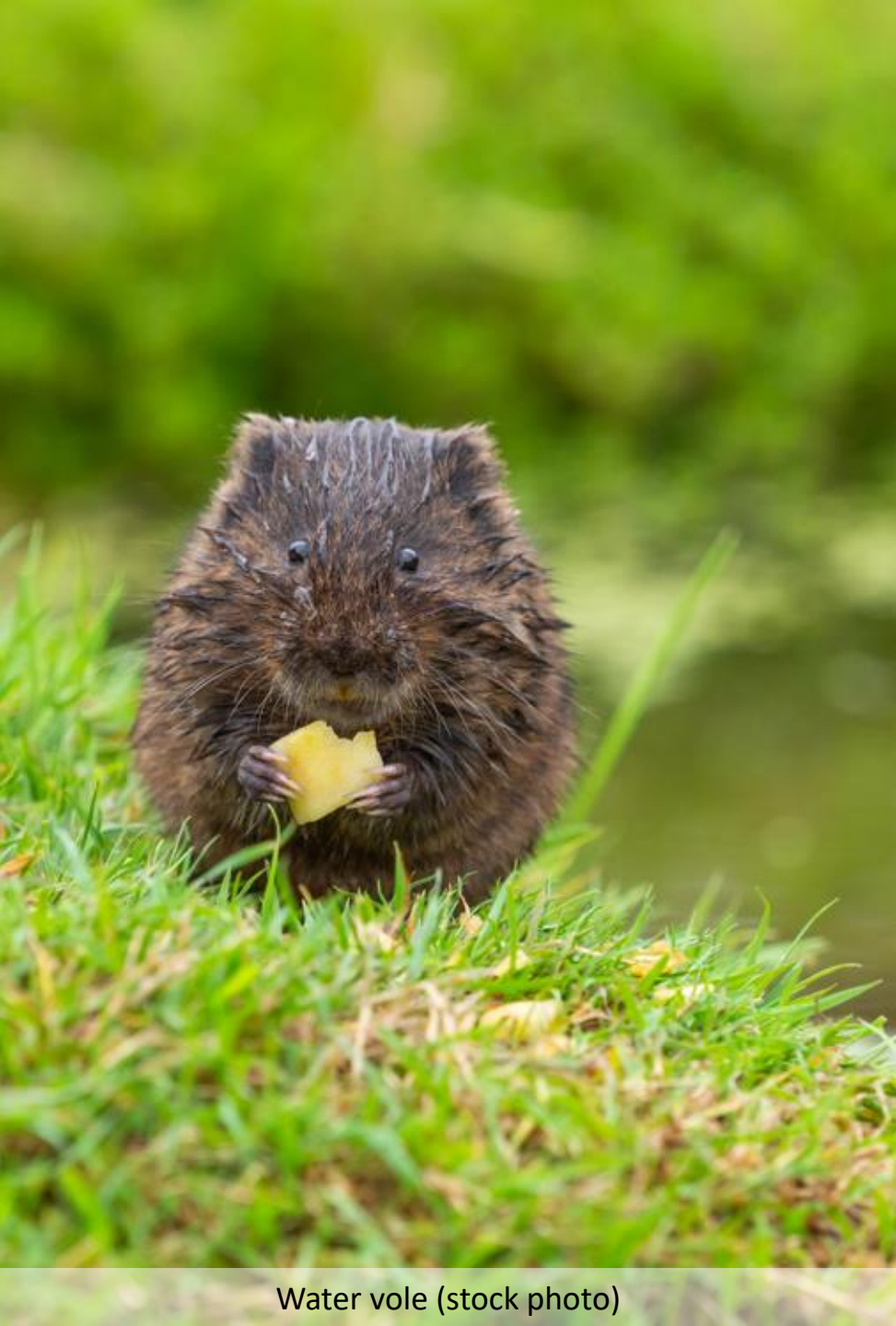
Water vole (stock photo)