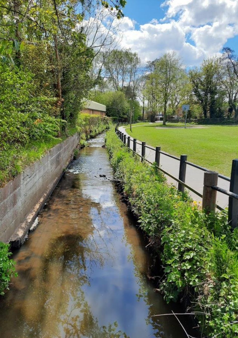
Battlefield Brook, Sanders Park, Bromsgrove