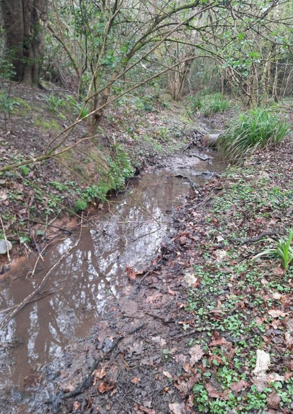
Callow Brook, Callowbrook Park, Rubery